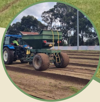
Sports Field Reconstruction & Renovation