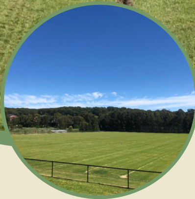
Open Spaces Maintenance